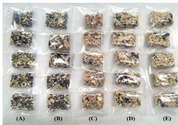
Figure 1. Crispy rice bar products (A) Leum Phua sticky rice, (B) Riceberry rice, (C) soaked RD6 in water from Leum Phua sticky rice, (D) combined RD6 with Leum Phua sticky rice, and (E) RD6 sticky rice

and Riceberry rice significantly presented the darkness color whereas RD6 sticky rice showed more brightness (Poomipak et al., 2018). It can be explained that anthocyanin accumulation in Leum Phua and Riceberry resulted in lower of brightness scale.